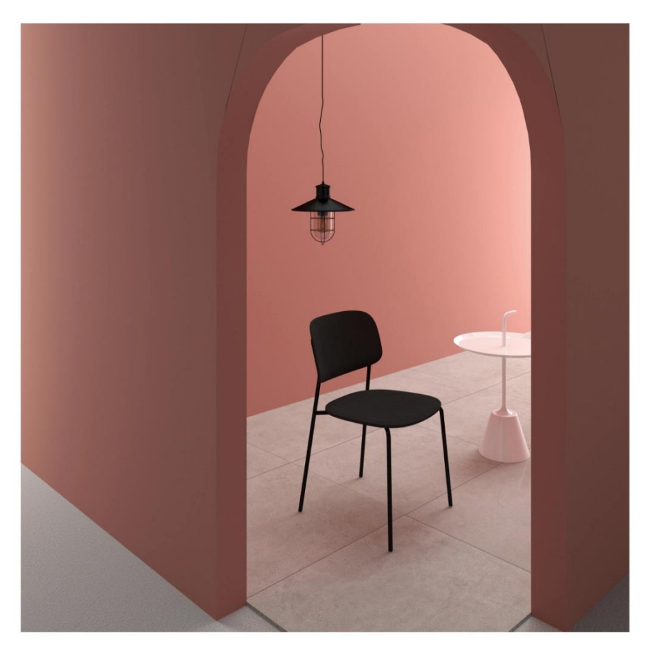
curved wood chair combines Scandinavian design with ergonomics durability and human dimensions. To a certain extent, it achieves the perfect combination of beauty and texture. Its back and seat plate shape the body that embraces the experiencer, and the cast steel frame is welded to provide a stable and durable chair.